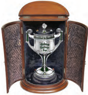
Plate 4. A possibly unique Australian silver, gem set, enamelled art nouveau presentation cup, in its original oval, silver-mounted cedar case. The difficult-to-make enamelled inscription reads 'So strive that ye May Obtain' 14 with a separate detachable shield 'Woodstock Challenge Cup'. The base is set with opals (NSW), the stem and the handles with greenstone (New Zealand), Gaspiete (WA) and Rock Crystal (SA); the stones from Tasmania, Victoria and Queensland have so far not been identified. The cup was made by John Piora 15 (d. 1938) and retailed by Prouds Ltd, 1906. I subsequently sold this cup to the Powerhouse Museum, Sydney.