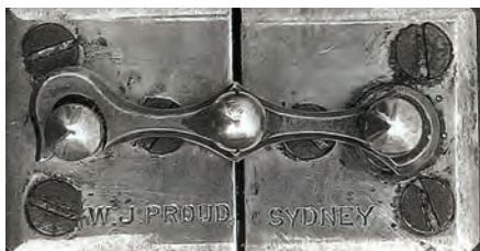
5B. Woodstock Challenge Cup, W J Proud Sydney marks to the front clasp of the oval cedar case, 1906.