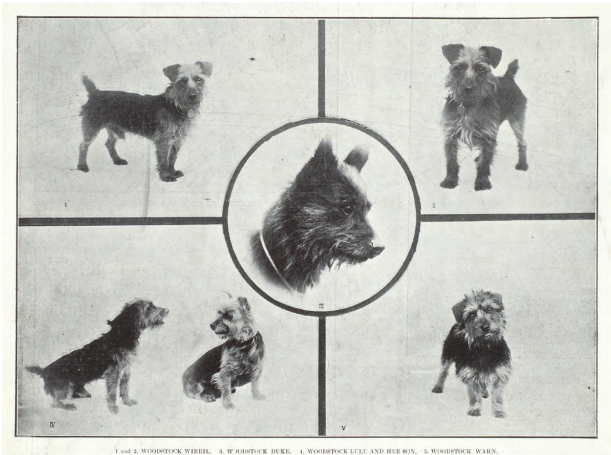
1 and 2. WOODSTOCK WIRRIIL. 3. WOODSTOCK DUKE. 4. WOODSTOCK LULU AND HER SON. 5. WOODSTOCK WAHN.